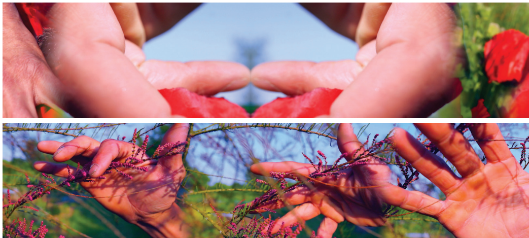
MERCY GARDEN (VIDEO STILL), 2013 / 2014. AUDIO VIDEO INSTALLATION

Many consider her to be a feminist; whilst she is female Pipilotti is primarily concerned with bodies in space. The references to gender are both subjective and objective; she wants to draw attention to our experience of the world but this is achieved through the projections of her own vision. She is interested in how we move around an exhibition and respond to the work. Pipilotti wants us to look at the world close-up, and become immersed in her landscapes. There is always a sense of happiness and fun in her work. The main theme for this exhibition comes from her experience of living in Bruton during 2012 - 2013.